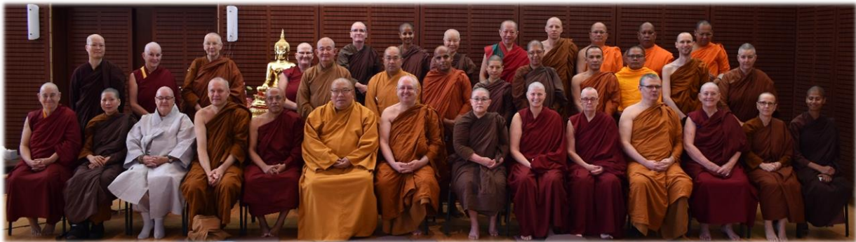
Photo: Monastics who attended the 2018 ASA AGM at Jhana Grove Retreat Centre in W.A.

The 2018 ASA AGM held in Western Australia was a great success with thirty-five monastics and a number of lay people from around Australia attending. If you would like to listen to the ASA AGM 2018 or access information about the topics discussed during the ASA Conference, simply go to the ASA in WA 2018 – Resources & Links page accessible from www.australiansangha.org/ . There you can find information on: