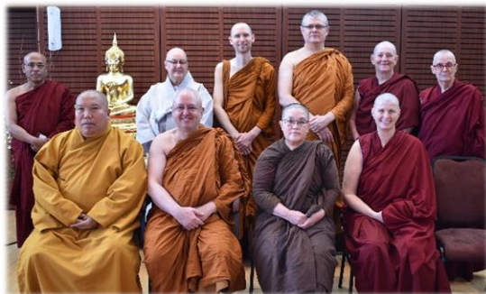
Photo: 2018-2019 ASA Committee members

The two-day AGM and Conference event was a great success due to the efforts of many, in particular the hard working Jhana Grove volunteers! A big thank you to all who assisted and to all who attended. We hope to see you at next year's AGM and Conference day which will be held on Tuesday 12 March in Melbourne.